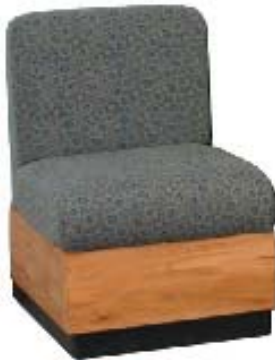
Single Seat 24"L x 30"D x 36"H Weight: 56 lbs 40003