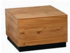
Corner Table 30"L x 30"D x 19"H Weight: 48 lbs 42004